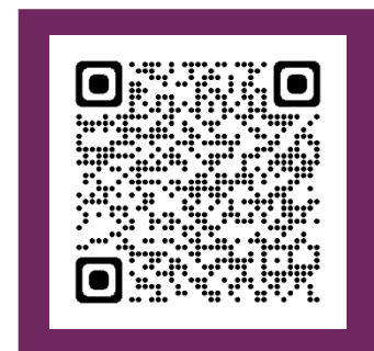
Coast Wide Training Solutions

At CWTS , we are not just consultants; we are partners in your journey towards regulatory excellence and educational success.